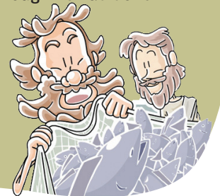
Bible story based on Luke 5: 1-11; Luke 22:54-62; John 21:15-19